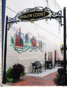
South side of the square.