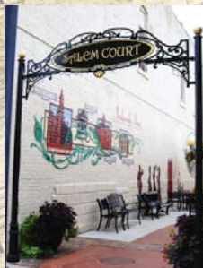
South side of the square.